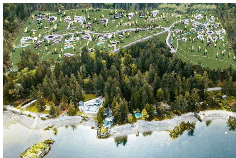
RTIST IMPRESSION OF PHASES 1A & 1B